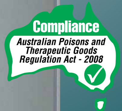
■ MODEL DS900