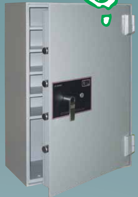
■ MODEL DS900