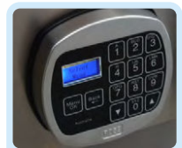
Digital Upgrade (CL2)