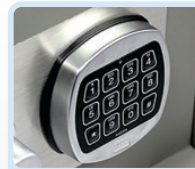
Digital Ross 1000