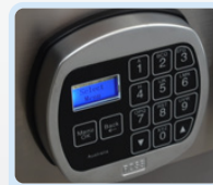
Digital LO2 - L22