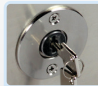
Key Ross 700