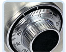
Combination - PS