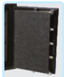
3 Way Locking