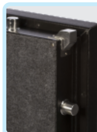
Unique Corner Bolts

Allow 50mm projection for door furniture on depth of measurement