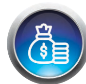
Recommended Cash Rating $ 20,000