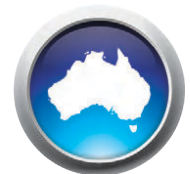
Aus-made Digital & Key Locks