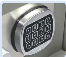
Digital Ross 1000